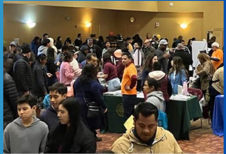
Community members visiting sponsor tables